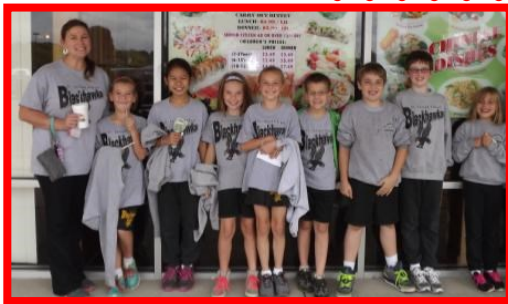
Tokyo Dragon - 3rd & 4th gr. Experiencing the Japanese culture after reading the book Sadako and the Thousand Paper Cranes